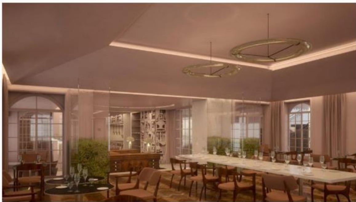
The Terreiro Brasserie has been inspired by the natural world.