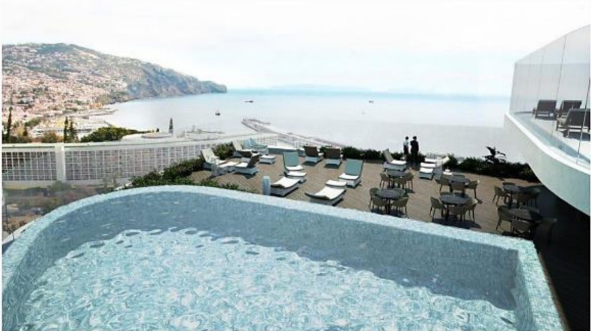
The new hotel is set to make a splash in Madeira. (CREDIT: SAVOY PALACE)

Now, the island is looking to make its mark with the luxury end of the travel industry, with the upcoming opening of the five-star Savoy Palace , part of the Savoy Signature brand of hotels, which is due to open this July 2019.