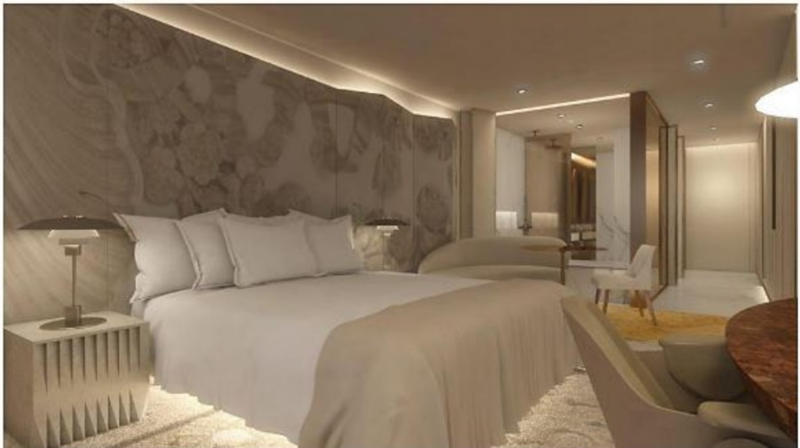
Bedrooms have a traditional yet elegant aesthetic.

It has a timeless feel, and is influenced by the Belle Époque period and the culture of the island. The design brings together a different number of elements: the exuberance of the surrounding landscape, the unique man-made environment of Madeira, particularly the old levadas and tunnels, the excellence and mastery of Madeira's embroidery, the centuries-old art of wickerwork and the expertise involved in the production of one of the best fortified wines in the world – Madeira Wine. Together these unique features underlie the metamorphosis between the conceptual inspiration and the interior design.