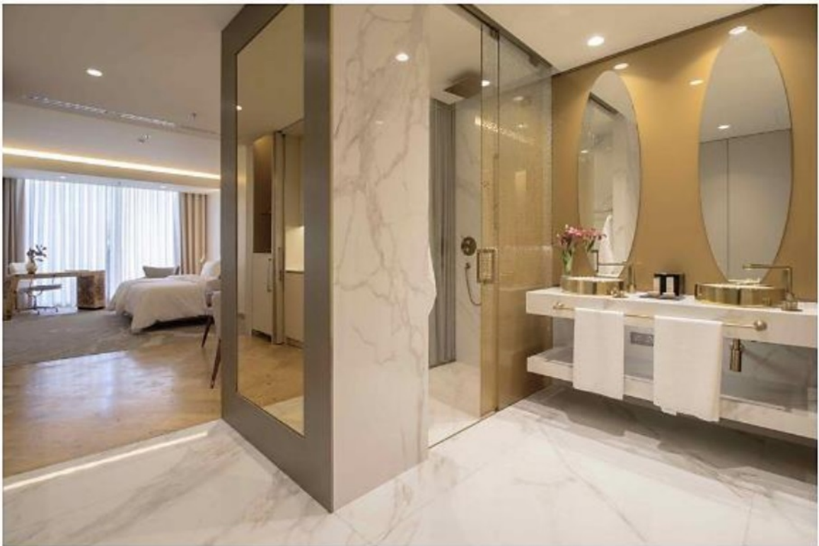
Marble bathrooms give a sumptuous finish.

It will no doubt be an incredible hotel, with unique values that will offer an unforgettable experience. It is an homage to the customs, idiosyncrasies and special characteristics of the island. There's nothing else like it here.