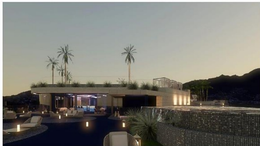
The new Savoy Palace is bringing a touch of luxury to Madeira.

Last year, when Madeira was voted Europe's 'Leading Island Destination' in the World Travel Awards for the fifth year running, it firmly kissed goodbye to its reputation as destination of choice for sedate retirees. Shaking off its staid reputation further is the fact that travel aficionados are falling over themselves with the 'discovery' that it is actually an interesting part of the world, rather than a dull one – (echoing the iconic writer, and passionate traveller, Ernest Hemingway's love of the island).