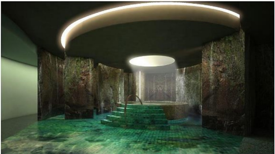
The spa is one of the standout areas of the hotel.

But being honest, I can't choose just one favourite area because as you pass between the different floors of the hotel, you come across different types of environments, all very inspirational with the emphasis on bright colours, sinuous curves, suggesting plant forms, animals and femininity, as well as ornaments clearly based on Art Nouveau. It's like taking a walk through Madeira.