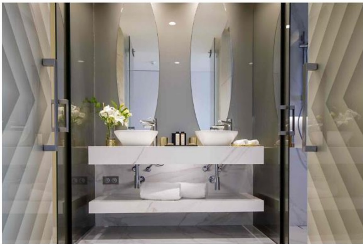
Elegant detailing throughout has a Belle Époque feel.