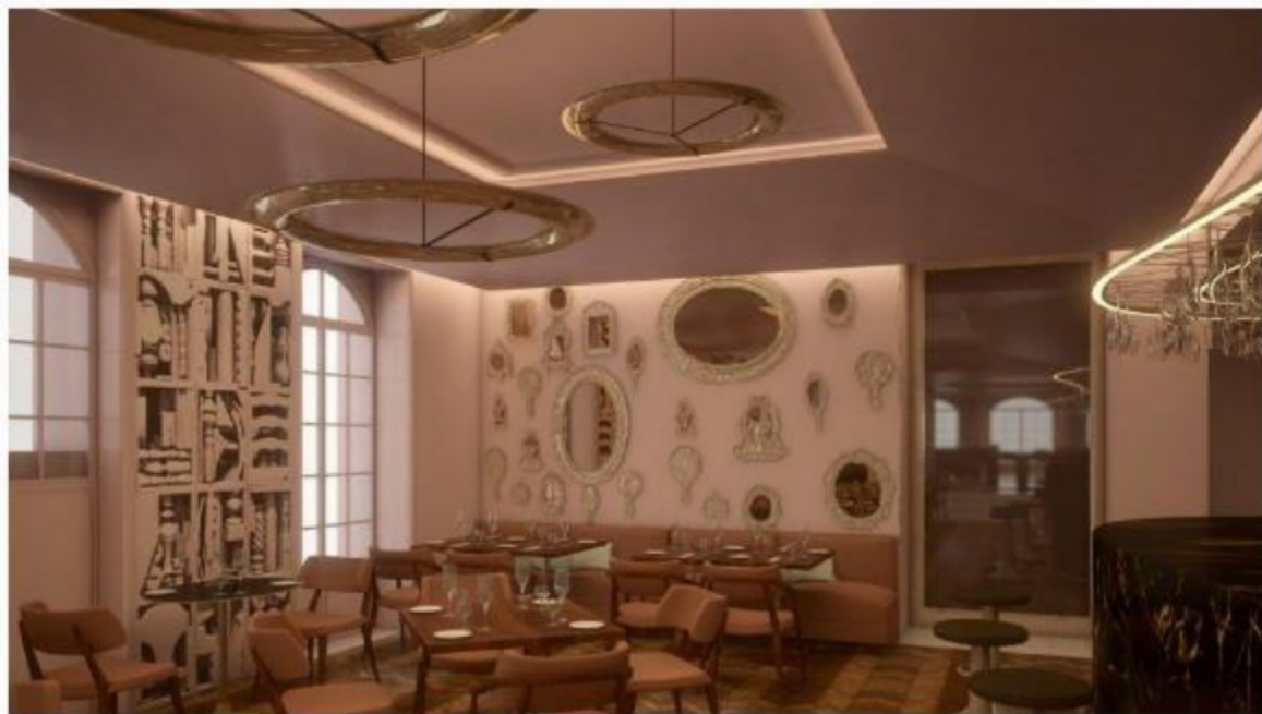
The Terreiro Gastrobar has a quirky feel.

Entering this hotel will be like entering a poetic world, where colour, textures and iconic objects are all important. With exclusive furniture pieces designed by my team, the main design influence is deeply rooted in Madeira's collective memory, with a great emphasis on elements of nature, which produce a visual interplay between the language of the building itself with the voluptuousness of its interior.