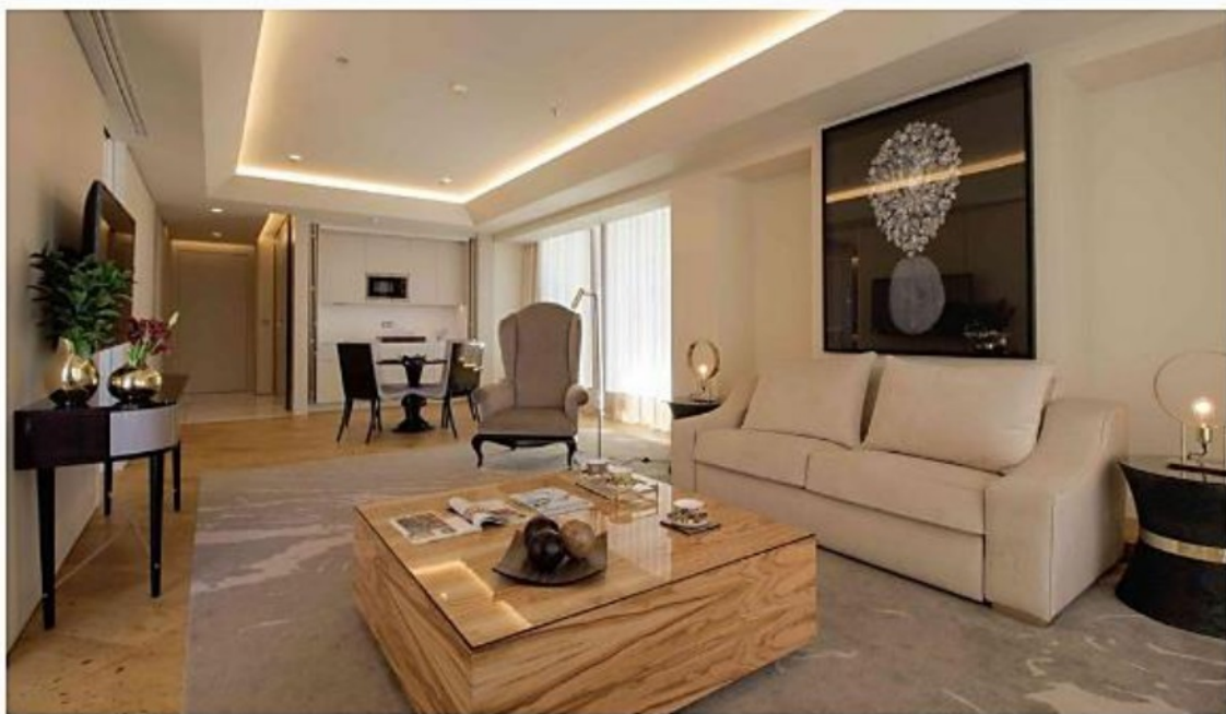
Madeira is the main source of inspiration in the interiors.