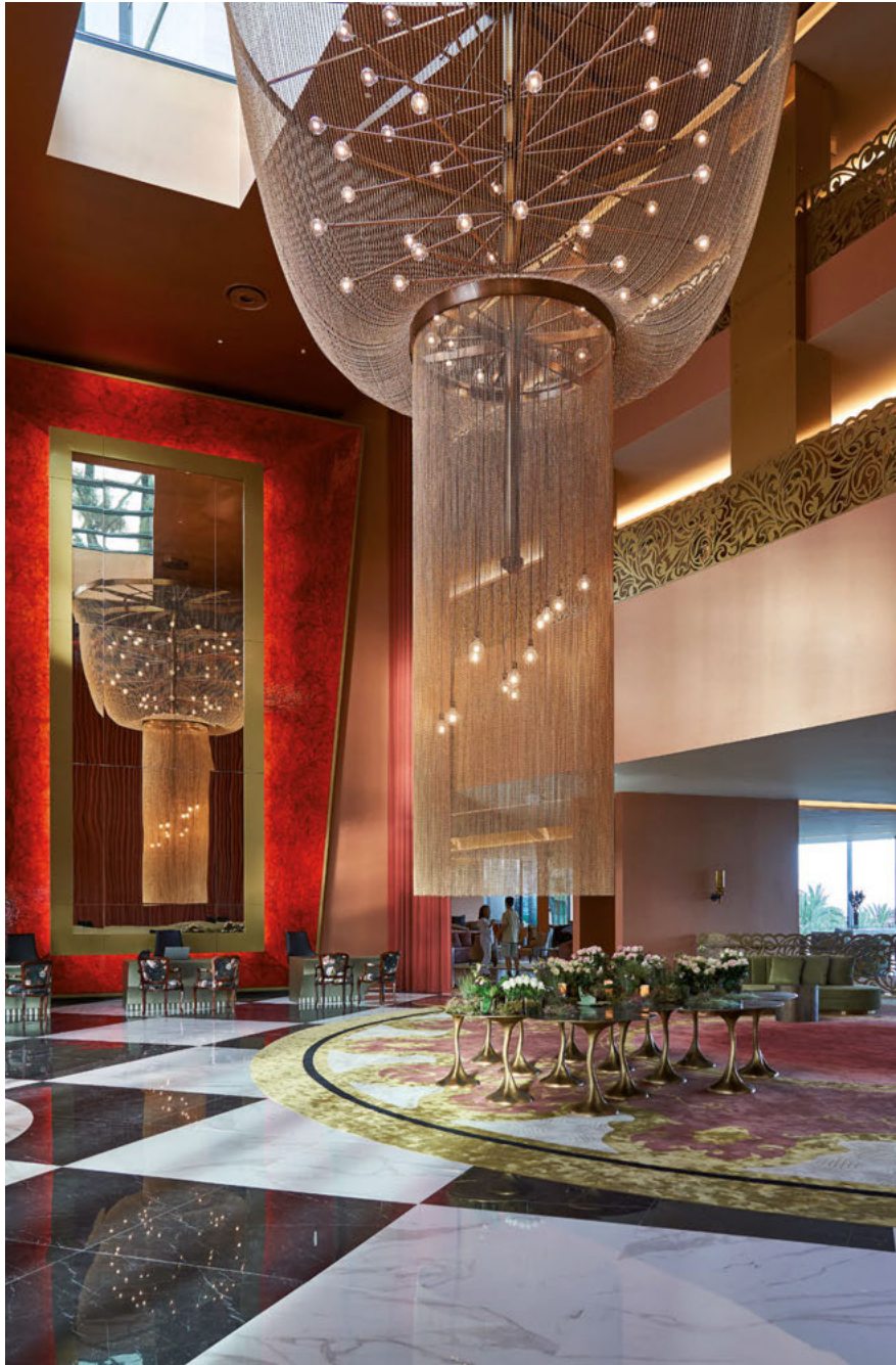
The lobby is dominated by a monumental chandelier, suspended over a bespoke carpet by Portuguese rug-maker Ferreira de Sá, which is itself a work of art

Located on a central avenue overlooking the ocean, Savoy Palace occupies the site of the former Classic Savoy, a Madeira institution that first opened its doors in 1912. The hotel's demolition in 2008 was a controversial move, particularly amongst locals who spent decades in awe of the property, but serious structural issues meant developers had little choice but to start again from scratch. The new incarnation is a bold addition to the skyline; a gently curving structure with floor-to-ceiling glazing across its 17 storeys. Inside, the legacy of the Classic Savoy lives on, with the aesthetic a contemporary take on the history and traditions for which the island is known.