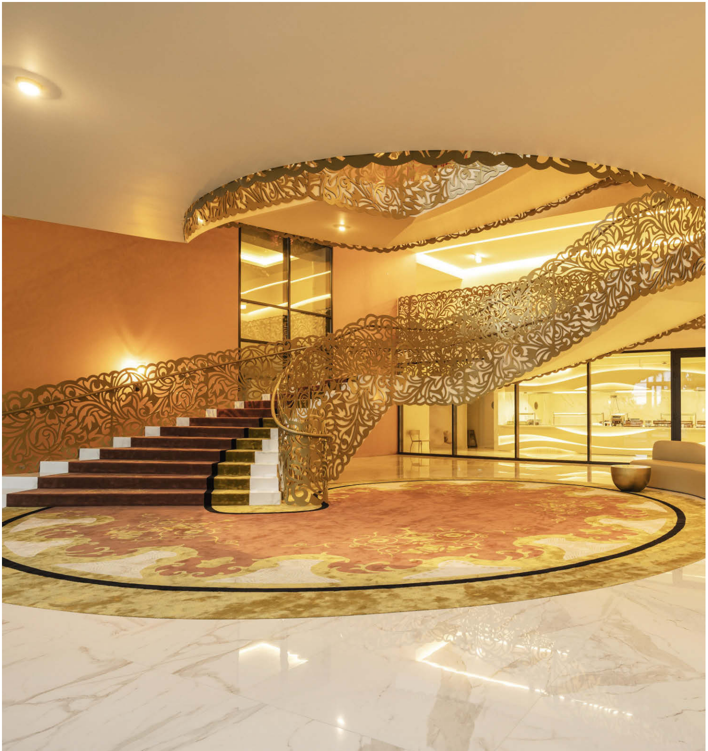
Lobby Staircase - Savoy Palace Tribute Cosmopolitan Resort | Madeira Island, Portugal