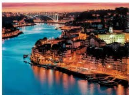
Above: the beautiful coast of Porto is illuminated come sundown

THE LOWDOWN: Two nights will cost you Dhs2,725 for a superior room/double occupancy, breakfast and access to the pools, gym and wellbeing area, and Caudalie Vinotherapie Spa. Flights throughout December with Lufthansa from Dubai International Airport to Porto – with one connecting stop in Frankfurt – start from Dhs4,321 ( ebookers.com ).