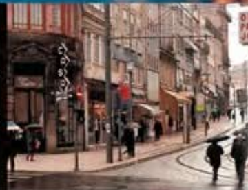
Downtown Porto is full of hidden gems waiting to be discovered