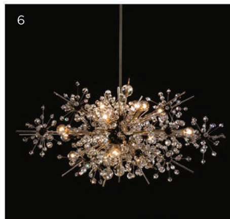
6. Metropolitan Lobmeyr