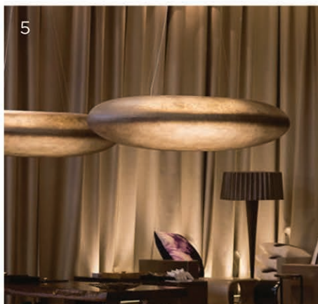
5. Garota do Calhau Nini Andrade Silva

As suggested by its curvaceous shape and natural hues, Nini Andrade Silva's design is inspired by the eternal pebbles of Madeira Island, Portugal. Once the Garota do Calhau Collection was born, it gave name to a cause whose purpose is to help the less favoured and open up paths towards new opportunities.