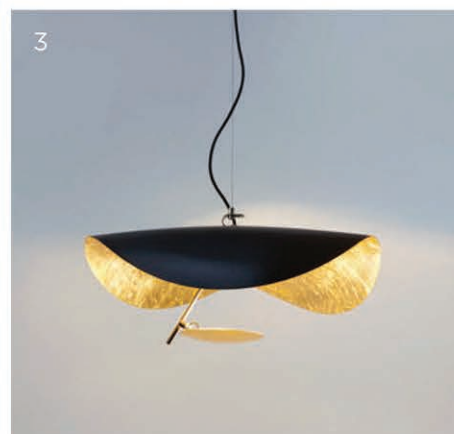
3. Lederam Catellani & Smith

The Lederam collection includes floor, wall and ceiling versions, with its latest version being a suspension lamp. This unique collection is characterised by a last-generation LED module enclosed by one, two or three discs finished with a sheet coloured black, white, copper, gold or silver.