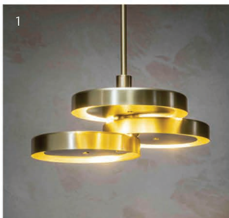
1. Triarc Bert Frank

With three intersecting brass discs hung from a single drop, the Triarc chandelier makes a dramatic impression. Grouped together with two or more pendants, it creates a sculptural focal point. The Triarc chandelier is available with opal or black diffusers, and in satin brass with white or black diffusers.