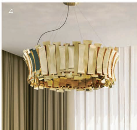
4. Etta Round DelightFULL

Etta Round suspension fixture has a nostalgic feminine retro glow, courtesy of the jazz singer Etta Jones. It is a luxurious chandelier that provides a soft and warm light through its layers, giving a romantic ambiance to any setting. All brass leaves are shaped and assembled by hand, with custom versions available upon request.