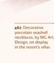
462: Decorative porcelain seashell necklaces, by MG Art Design, on display in the resort's villas