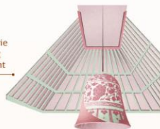
800: Weight in kilograms of the Ming Dynasty-inspired chinoiserie bell in the Li Long Chinese restaurant

Ithaafushi Island, South Malé Atoll, waldorfastoriamaldives.com. Rates: from $2,600