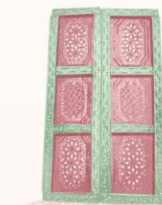
31: Antique Arabic doors and windows, some 400 years old, at Yasmineen, the hotel's Middle Eastern restaurant