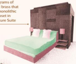
600: Kilograms of burnished brass that clad the monolithic walk-in closet in the Signature Suite