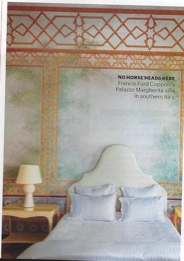
NO HORSE HEADS HERE Francis Ford Coppola's Palazzo Margherita villa in southern Italy.

🔥 The specs: A sexy 55-room design hotel on the edge of the vibrant Zona T shopping and